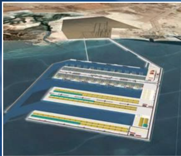
Port of Khalifa (UAE)