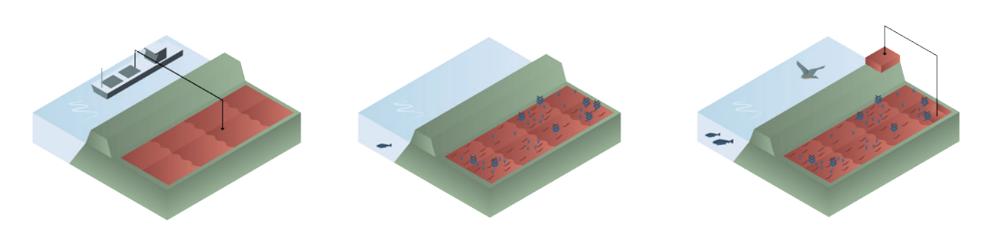
Figure 1. Sediment is deposited on land (in this illustrative case, in drying cells), possibly treated and reclaimed for other subsequent beneficial uses (in this case for dyke reinforcement).

sediments are not dredged or transported by humans but use natural systems and engineering tools as sediment management measures.