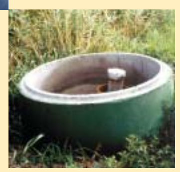
A monitoring well is used to test groundwater quality, in the vicinity of the Francop site.

This separation and dewatering plant consists of several hydrocyclones, which solidify dredged material, thus reducing its quantity.