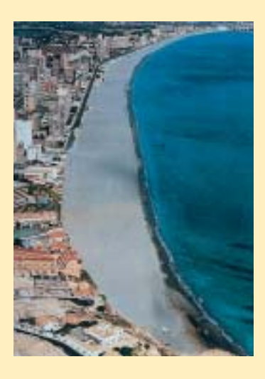
Beaches in Alicante, Spain, before replenishment (left) and after (right). Beach nourishment is now commonplace in many parts of the world and the demand for dredged materials from offshore borrow areas has consequently increased significantly in recent years.

Dredging is also often undertaken in order to: