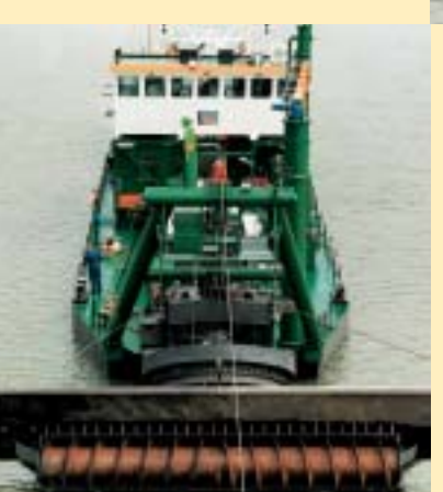
Artificial gravel, produced from contaminated dredged material, is used in manufacturing concrete.